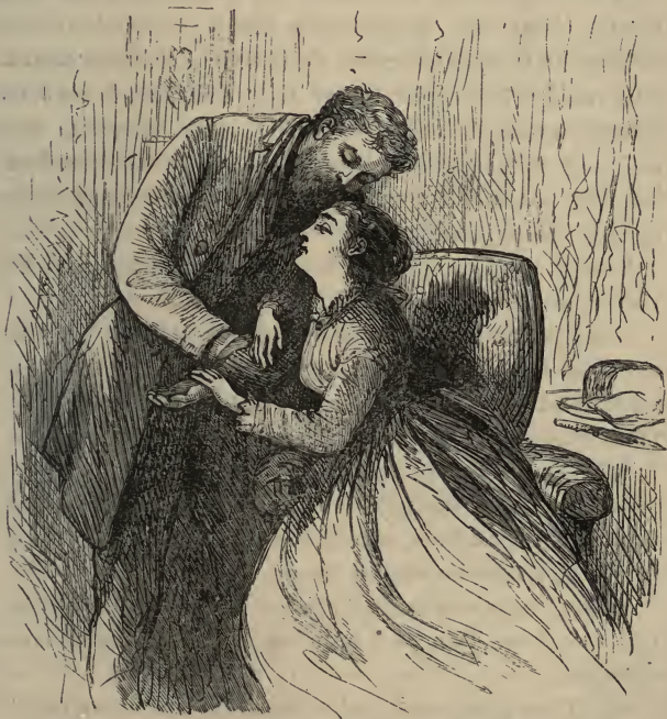
"ONE HAPPY MOMENT."

"Poor Christie, it's hard that you should go away